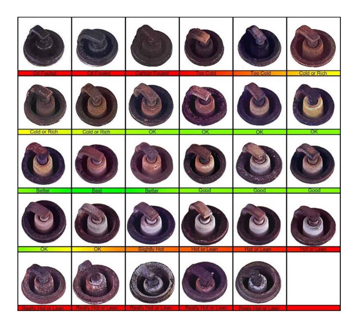
first picture up left is #1, last picture down right is #29, "best" is #14